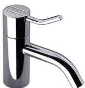
HV1M Same as HV1 with medium lever