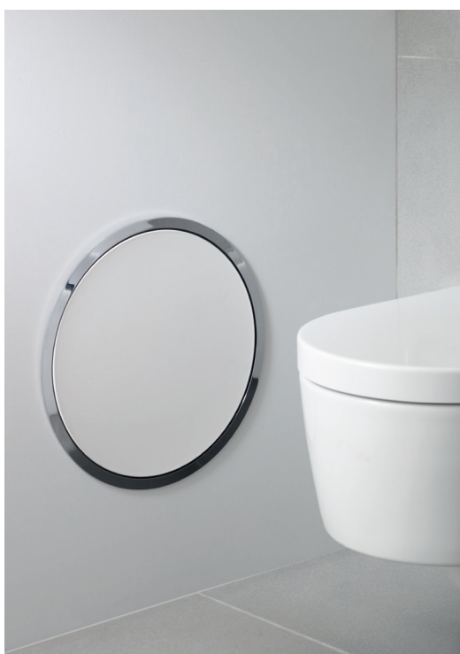
RS3 Retrofit waste bin.