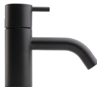
27 Matt Black