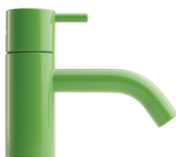
06 Light Green