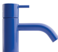
04 Light Blue