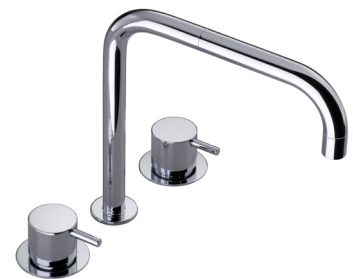
KV4 Two-handle mixer with double swivel spout