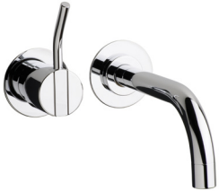
111M Same as 111 with medium lever