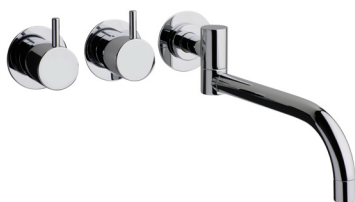
631 Two-handle mixer with double swivel spout