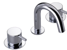
HV5 Two-handle mixer with swivel spout