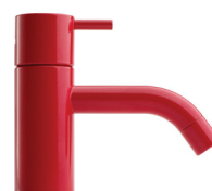
21 Carmine Red