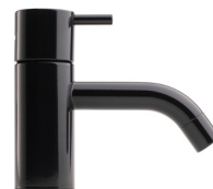
17 Gloss Black