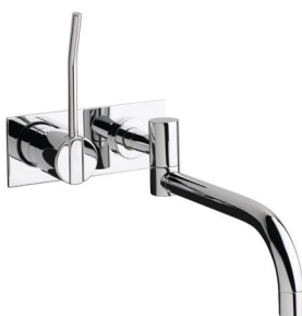
132L Same as 132 with long lever