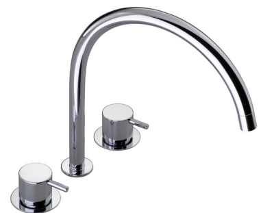
KV15 Two-handle mixer with swivel spout