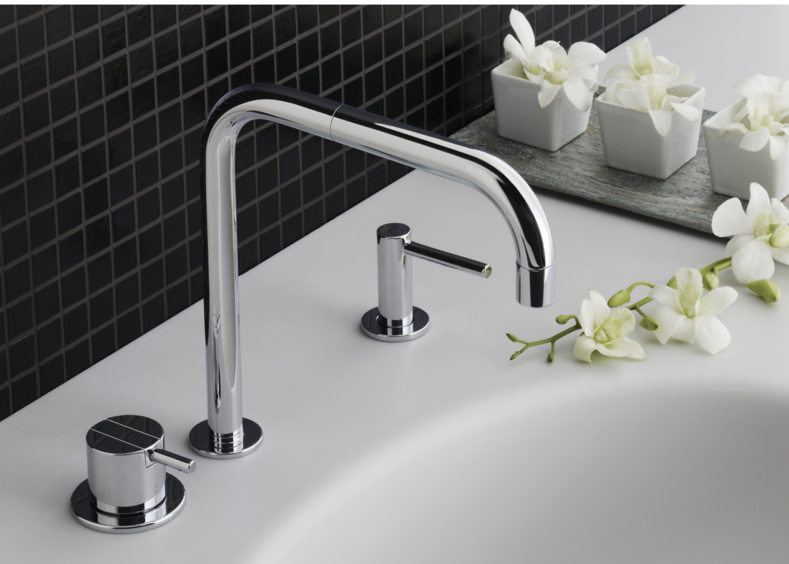
590T36 One-handle mixer with double swivel spout and soap dispenser