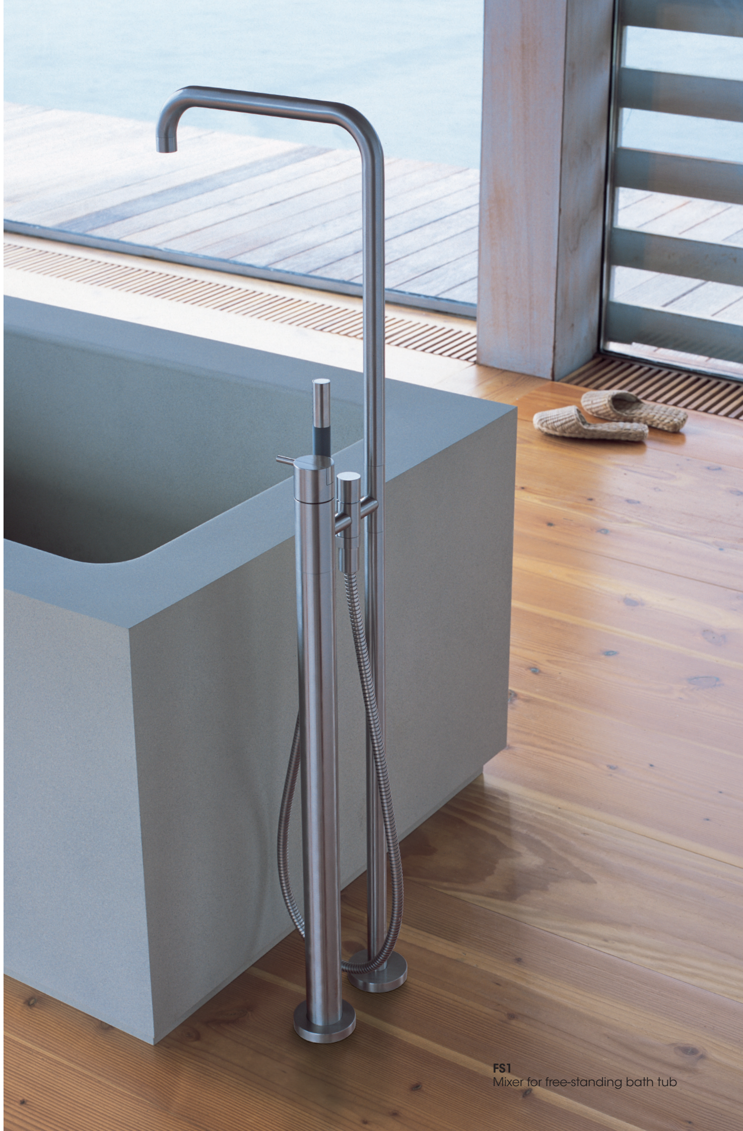
FS1 Mixer for free-standing bath tub