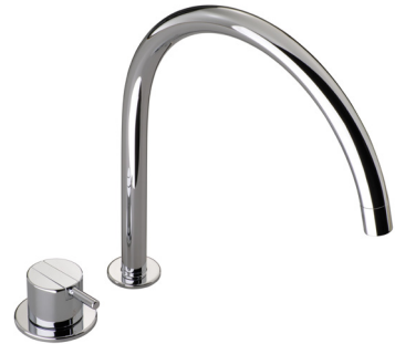
590H One-handle mixer with swivel spout