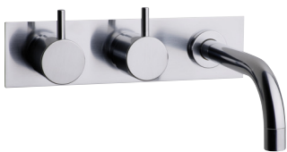
613K Two-handle mixer with fixed spout