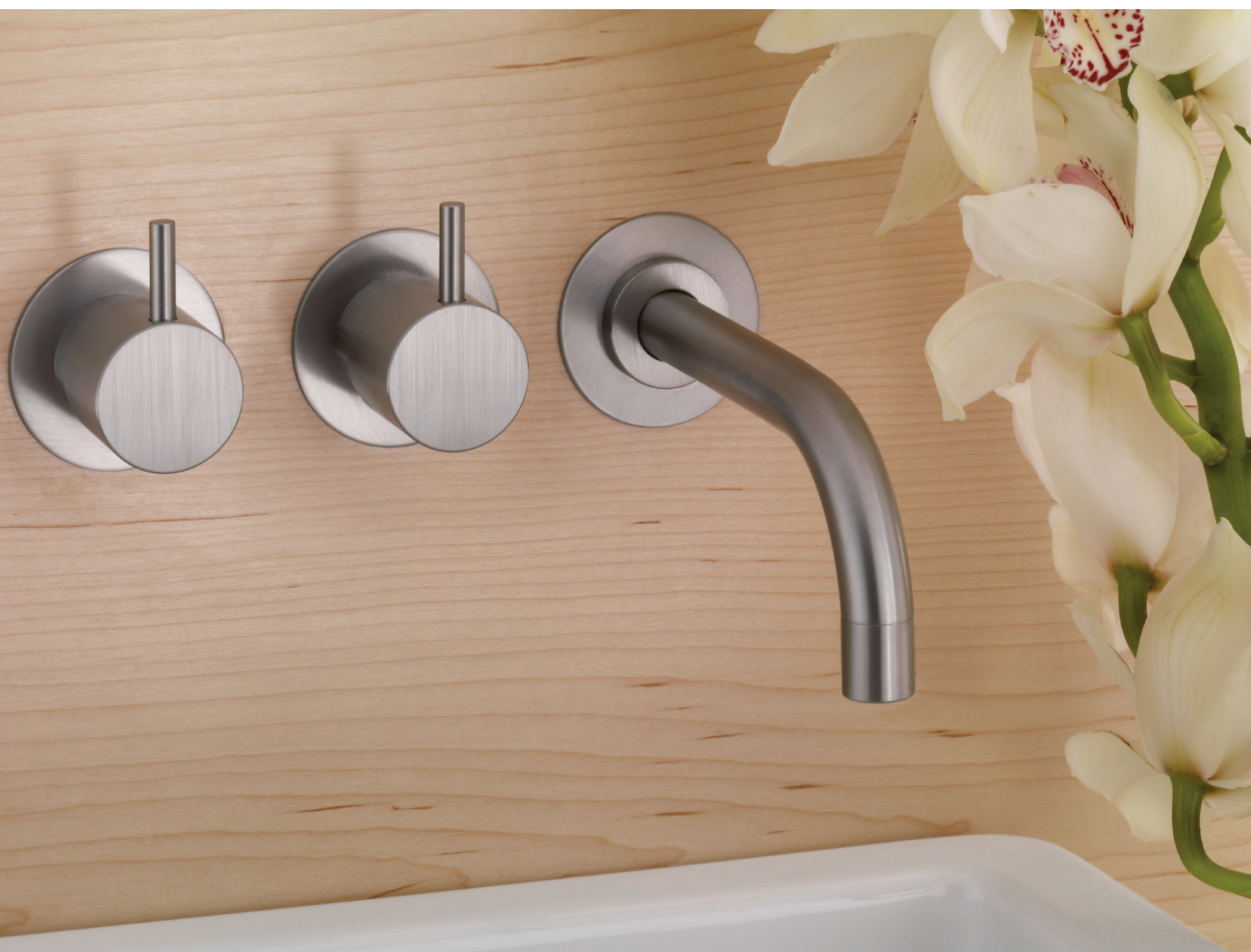
611 Two-handle mixer with fixed spout