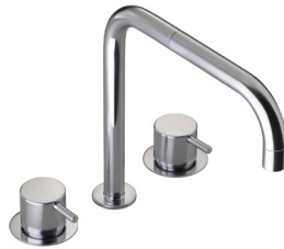
KV10 Two-handle mixer with swivel spout