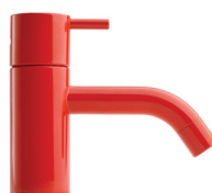
14 Bright Red