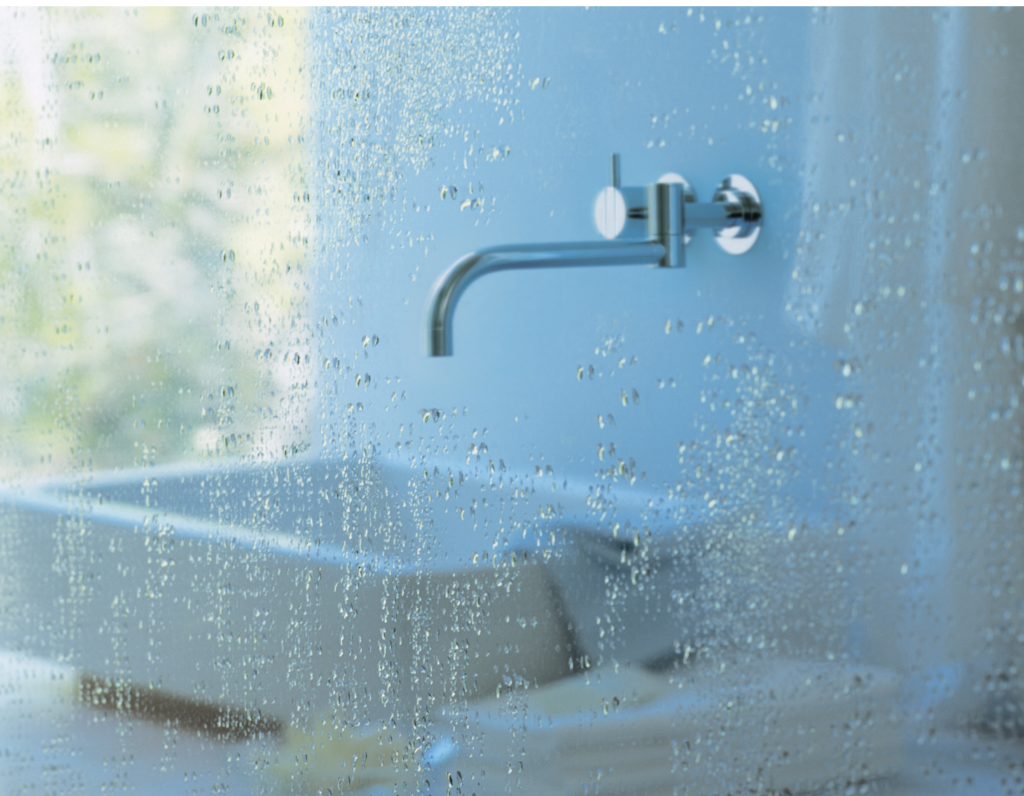
634T4 Two-handle mixer with double swivel spout and soap ring