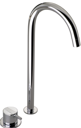
590V One-handle mixer with swivel spout