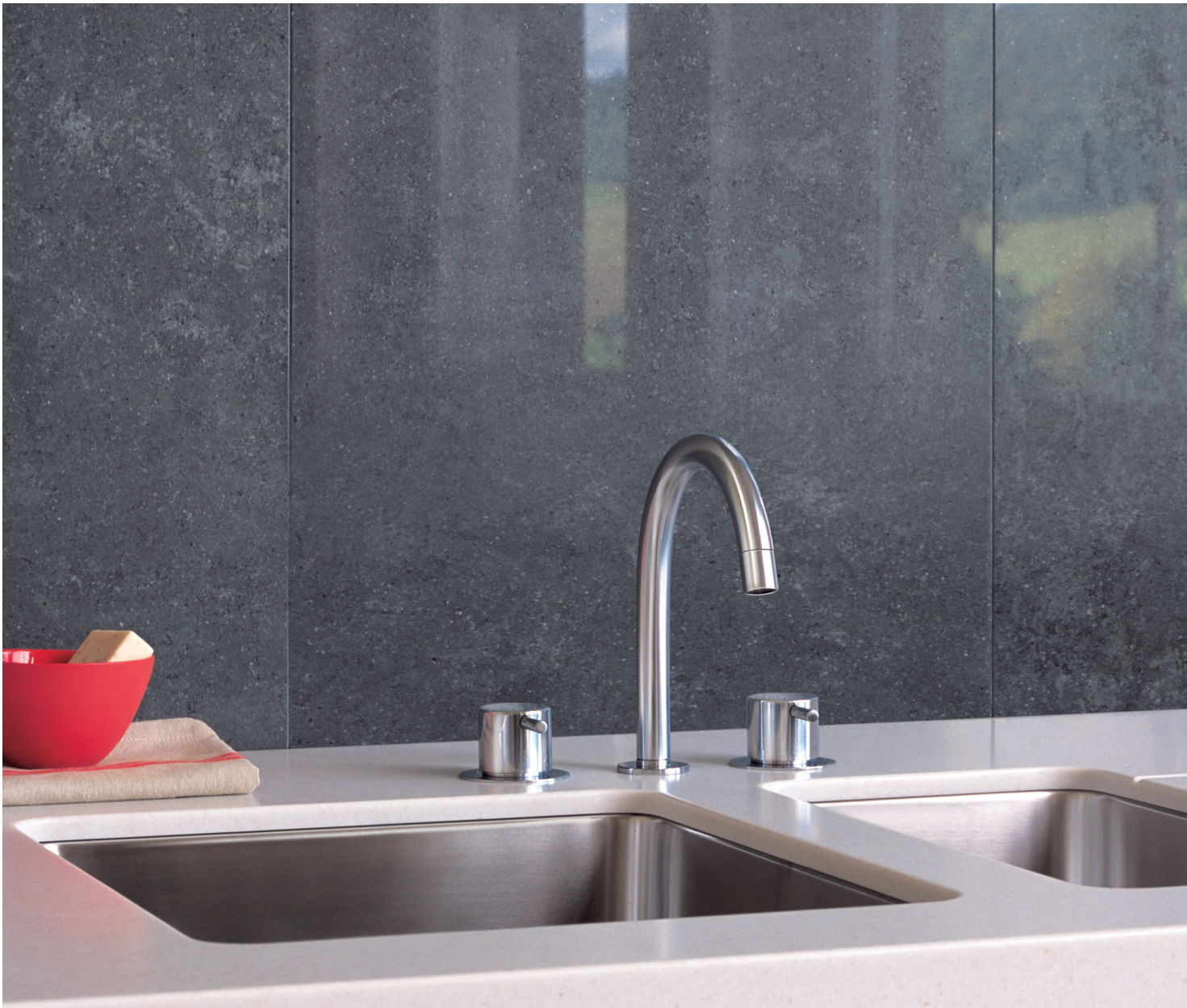
KV15 Two-handle mixer with swivel spout