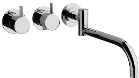
631 Two-handle mixer with double swivel spout