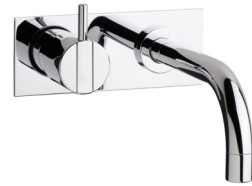
112 One-handle mixer with fixed spout