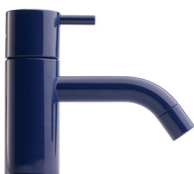
15 Dark Blue