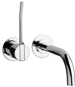
111L Same as 111 with long lever