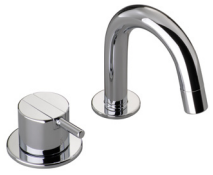
590A One-handle mixer with swivel spout