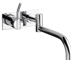
132M Same as 132 with medium lever