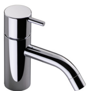
RB1 Pillar tap with fixed spout