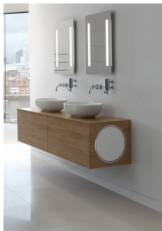
RS1 Far left: The waste bin can be mounted near floor level for use as a sanitary towel bin.