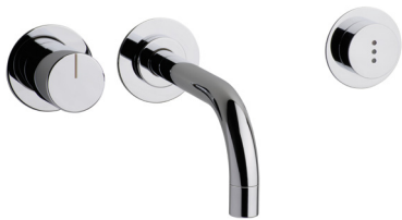
4111 Mixer with on-off sensor for 'hands-free' operation