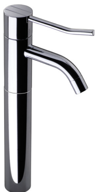
HV1L+170 Same as HV1 with long lever and with height of 290 mm