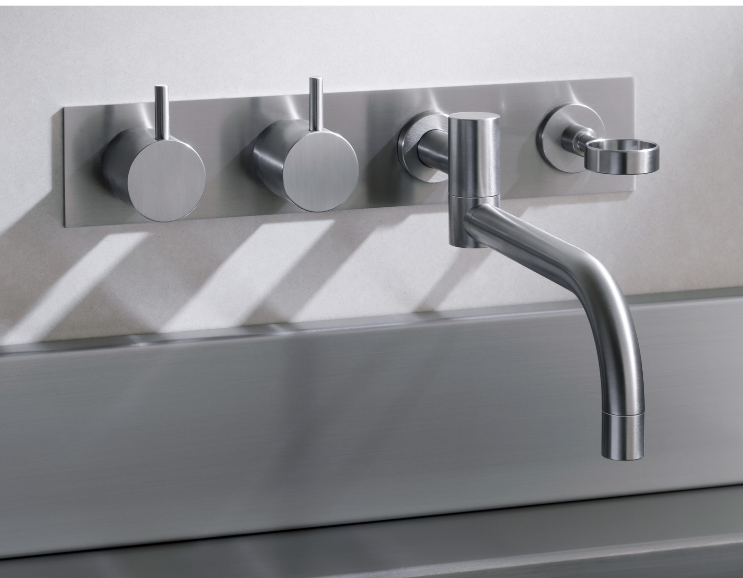
634T4 Two-handle mixer with double swivel spout and soap ring