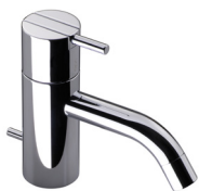
HV3 One-handle mixer with fixed spout and pop-up waste