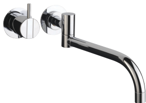
131 One-handle mixer with double swivel spout