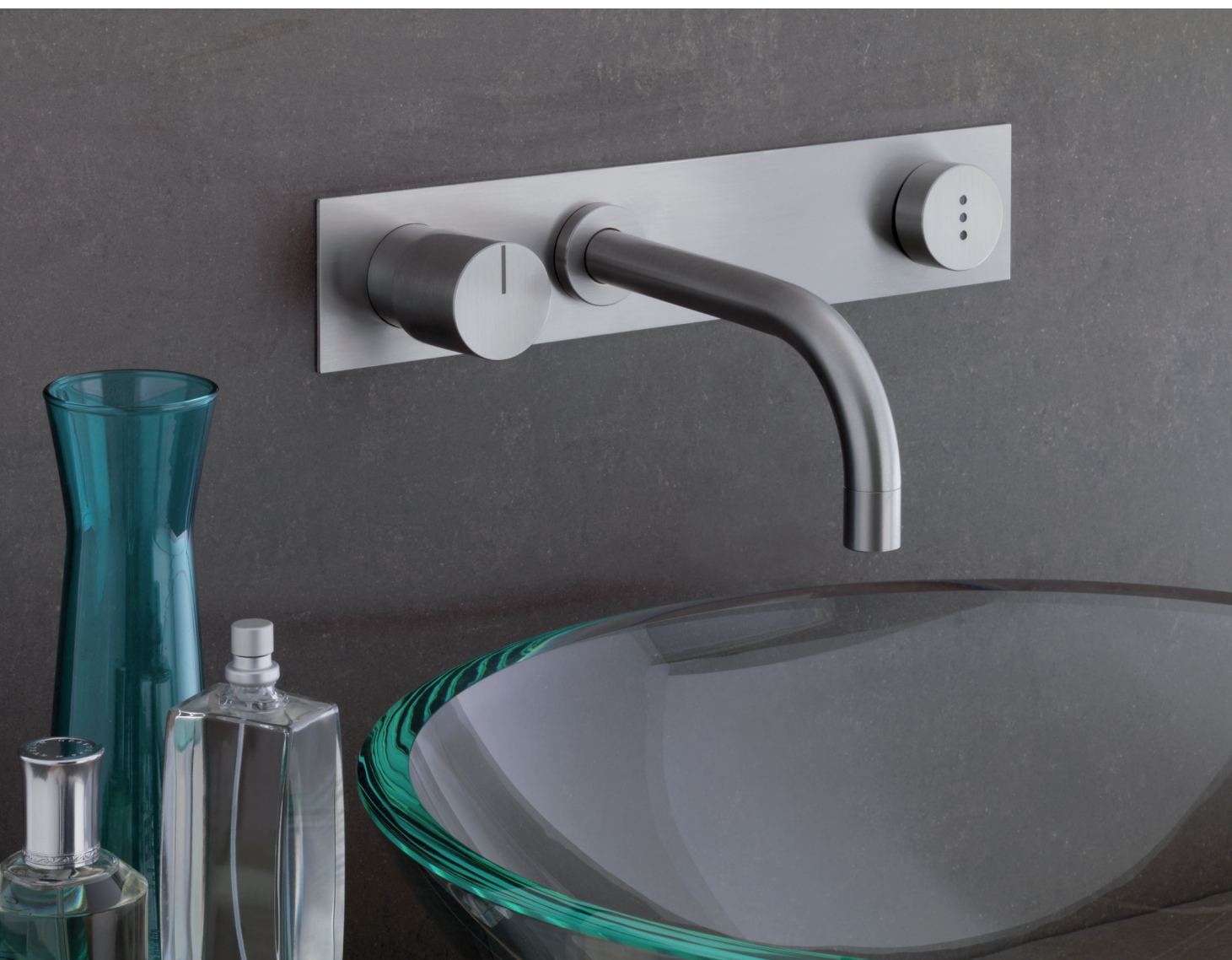
4113 Mixer with on-off sensor for 'hands-free' operation