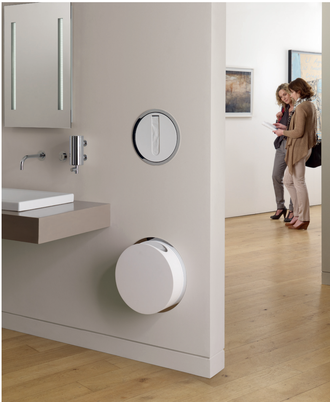
RS2 Build-in tissue dispenser.