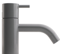
09 Dark Grey