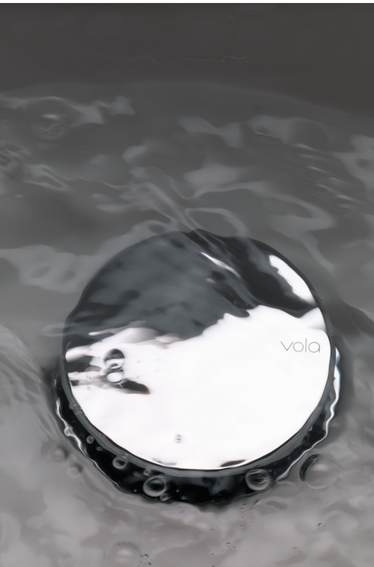
A2 Plug for pop-up waste